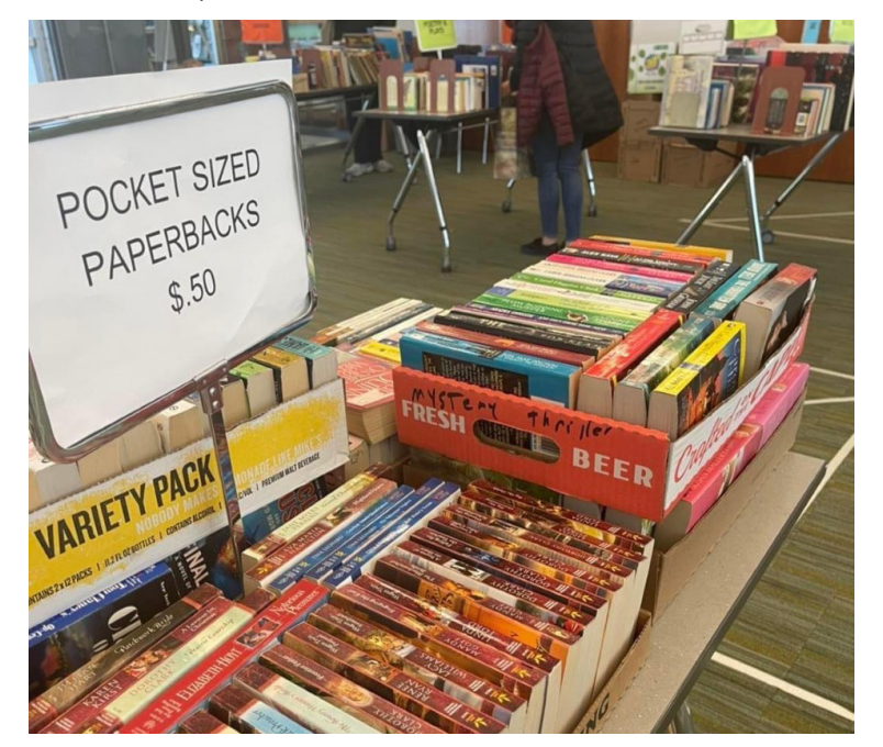
Need some light reading for the beach this summer? For 50 cents, you won't mind when your paperback gets full of sand. Get your beach read at the next sale on June 3 and 4...